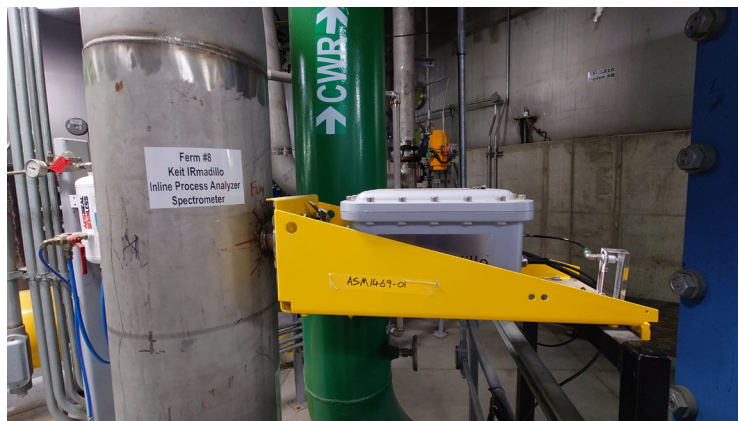
Photo: IRmadillo instrument installed in a recirculation line

This work has shown that the IRmadillo spectrometer is easy to install into a recirculation line on the fermenter, and can be calibrated to become a continuous, in situ and real-time nitrogen meter (along with a real-time HPLC style meter). The measurement of FAN in particular could prevent failed or sub-par batches, where there is a clear relationship between low FAN and low ethanol output – something that would not have been evident in glycerol measurements until much later. The return on investment for the IRmadillo could potentially have been obtained in that single batch – let alone any future issues.